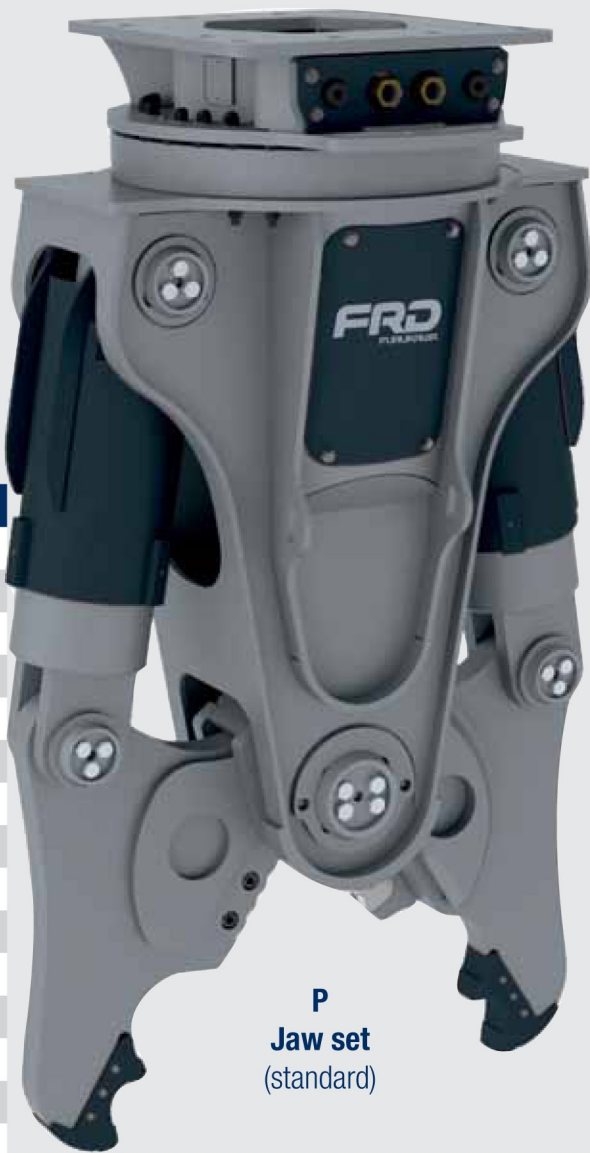
P Jaw set (standard)